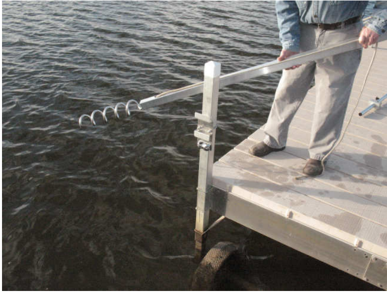
5.) Drop anchor down into the water, holding onto rope.