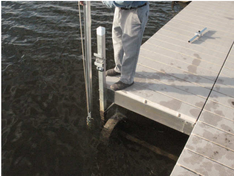
6.) Place spiral anchor where you want it and make a few turns by hand.